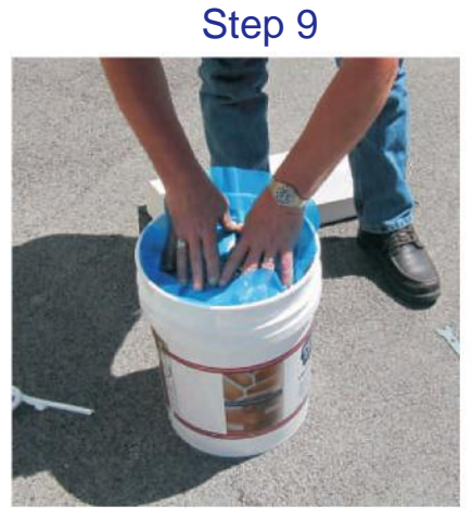
Replace plastic liner over the surface of the sealant.