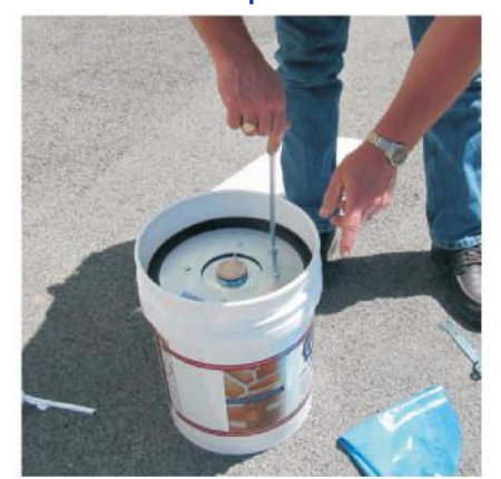
To remove the Follow Plate from an empty or partially full container, insert the handle rod into the open nut on the surface of the plate and pull it out.

Apply sealant using the same technique as you would use with a standard caulk tube and ratchet gun.