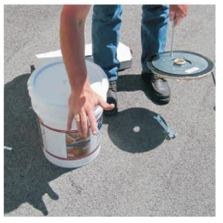
Replace the lid. Make sure that it is seated tight on the pail.