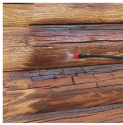
Spray Tip Pattern

Step 3: Start spraying the solution at the bottom of the wall and work your way up. If the solution begins to run down the wall you are applying too much. You only need to wet the surface, not saturate it.