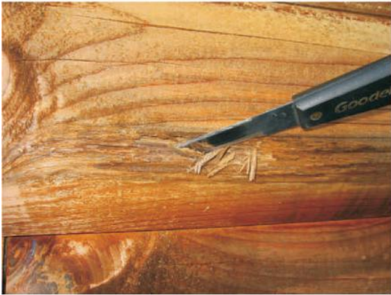
Pocket of Soft Rot

More wood is replaced each year because of decay damage than all other factors combined! Commonly called rot, wood destroying fungi need three things to survive, air, water, and food. Since we can't eliminate air and their food is the wood in our homes, the only mechanical control mechanism available to us is the elimination of water. Water is the enemy of wood! Although we've all heard the term "dry rot," dry wood will not rot!