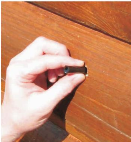
Inserting a Cobra Rod

Cobra™ Rods are two inch long, borate glass rods that can be used to spot treat decay prone areas such as log ends that are already coated with a finish. Once inserted into damp or wet wood the borate / copper complex in Cobra Rods dissolves spreading the active ingredients into areas surrounding the rod. Cobra Rods eliminate active decay fungi and help prevent rot for eight to ten years.