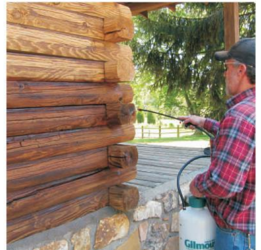
Applying a borate solution

If you have any questions about controlling decay fungi or repairing decayed wood give Perma-Chink Systems a call at 1-800-548-3554 (Eastern Division) or 1-800-548-1231 (Western Division). We have number of products that are designed for repairing damaged wood and preventing future problems from occurring.