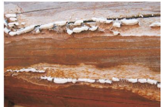
Shelf fungi on logs

stages the wood may become spongy to the touch. Wood attacked by white rot lacks the cubical checking appearance of brown-rotted wood. Shelf fungi, bracket fungi and mushrooms are all forms of white rot fungi.