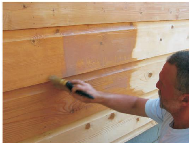
Back-brush finish to obtain a uniform film.