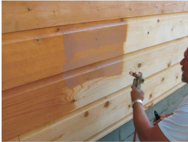
Spray apply finish to a small area.

The other method is to use the airless sprayer to carry the finish to the wall where it can then be brushed out. The trick is to work on small areas at a time. Although it takes longer than spraying large areas at a time, a single person can use this technique to finish their entire home. The objective is to apply some finish to a one to two foot section of one or two courses of logs and then brush out what you have applied as far as it will go. You don't want to apply too much finish and you have got to be quick with the back-brushing to avoid any stain from running down the wall. Just remember – A THIN EVEN COAT is the key.