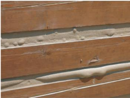
Blisters in thin layer of chinking applied over bare wood

For those cosmetic joints that are less than 3/8 inches deep the answer is fairly easy. Unless the log home manufacturer specifies the use of Perma-Chink, Chink Paint is less expensive and much easier to apply, especially if you are planning to do it yourself. Since there is no room for backing material, we have seen several instances when a thin layer of Perma-Chink was applied directly over bare wood and blisters formed in the chinking. Even if the bare wood is covered with masking tape it may still not be a good idea to use Perma-Chink.