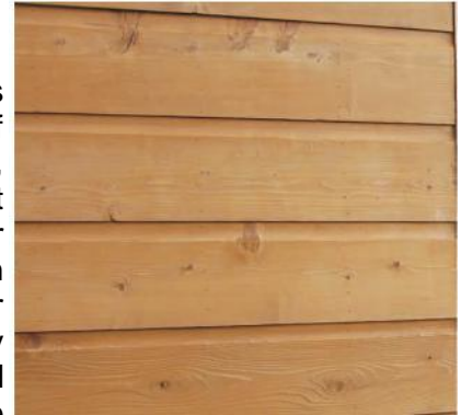
Wall with cosmetic chink joints

If the Perma-Chink only has a 1/4" lip of wood to hold onto on the upper and lower edges there may not be enough surface area for good adhesion. If Perma-Chink is applied and masking tape is used as a backer in shallow chink joints it's especially important to make sure that the tape does not cover any edges. If it does there will be