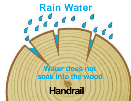
Finish film on wood surface and in fissures.

So, what do we suggest to assure adhesion of a finish to new handrails? The first thing is to wait until the handrails have reached a moisture content of less than 20% before doing anything. This may take two months or six months depending on how green they are and the diameter of the rails. By then most of the cracks and fissures will have opened up and any remaining cambium will have dried up and peeled off. The problem with this is that some people moving into a new home are not willing to wait to finish their handrails. If that's the case, the best course of action is to sand the handrails with 60 to 80 grit sandpaper as best you can, wash them down with Log Wash™, let them dry and then apply only one coat of any VISTA™ Deck. DO NOT APPLY ADVANCE™ TOPCOAT TO AREAS COATED WITH VISTA™ DECK. It will be best to apply VISTA™ Deck to posts, spindles, balusters and other vertical components of the deck as well for color and coating consistency. Once the handrails have had a chance to dry, the application of a second coat of VISTA™ Deck will seal any cracks and fissures that may have opened up preventing water penetration into the wood.