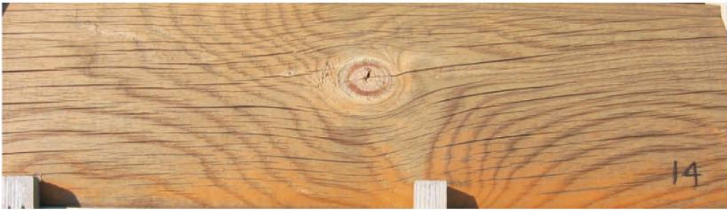
Fissuring of Log Siding

Round log siding probably presents the greatest challenge to forestalling the effects of weathering. Typically used in high exposure locations such as dormers and gable ends, in addition to suffering the same weathering characteristics as round logs, log siding has some features which makes it even more difficult to protect from the effects of the weather. Siding is often manufactured from lower quality wood than logs, frequently using green wood. This makes it more susceptible to twisting, warping and cracking. Since siding does not have the high thermal mass of full logs, during the summer months their temperature can range from 80° F to 160° F or higher during the course of one day. This puts a lot of mechanical stress on both the siding and its finish system resulting in small fissures forming on the surface. Rainwater can then enter these fissures and get behind the finish.