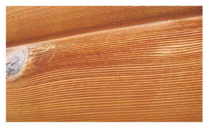
Examples of Media Blasted Surfaces