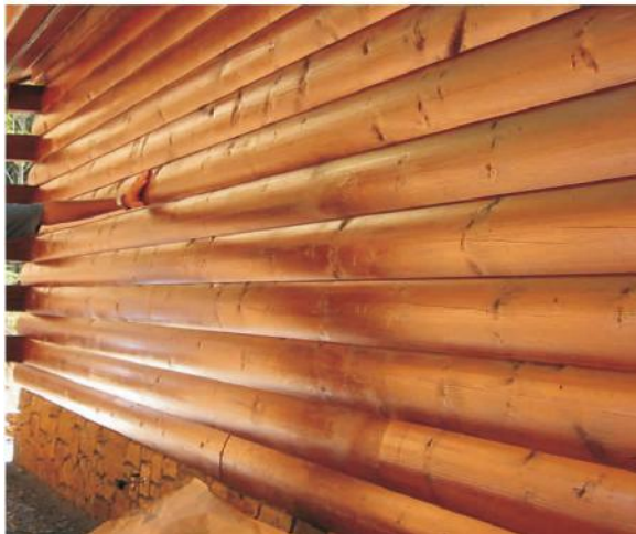
One of the first homes topcoated with Advance Gloss.

These are some of the reasons why LIFELINE™ Advance Topcoats play a key role in the performance of all of our exterior finish systems.