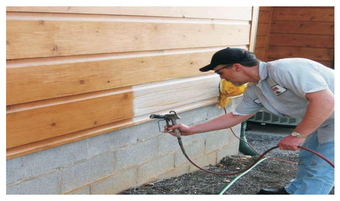
Applying S-100 Finish Remover Using a Wagner 9140S Airless Sprayer

After waiting an appropriate amount of time for the stripper to soften the finish (remember the colder it is the longer it will take) you can begin the pressure washing process. Be sure to wash off any product and wet finish debris that is still adhering to the wall or other surfaces. If allowed to dry you may end up having to manually scrub these surfaces clean. Once you reach the top of the wall or if you run out of time, rinse the entire wall starting at the top before you quit. You do not want any chemical or finish debris to remain on the surface. If you are finished for the day replace the lid on the pail of finish remover and run clean water through your airless sprayer until clear water comes out of the gun.