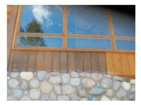
Section on left was wire brushed.