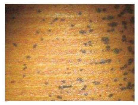
Spots created by steel wool.

Using wire brushes, steel wool or metallic abrasives to aid in the removal process of old finishes or to smooth the surface will create discoloration problems. Small bits of metal will be deposited on the wood and the use of these materials should be avoided at all costs.