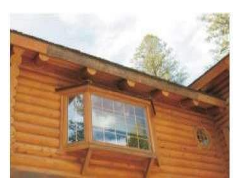
Section of fascia that was wire brushed.