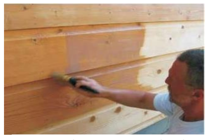
Back-brush finish to obtain a uniform film