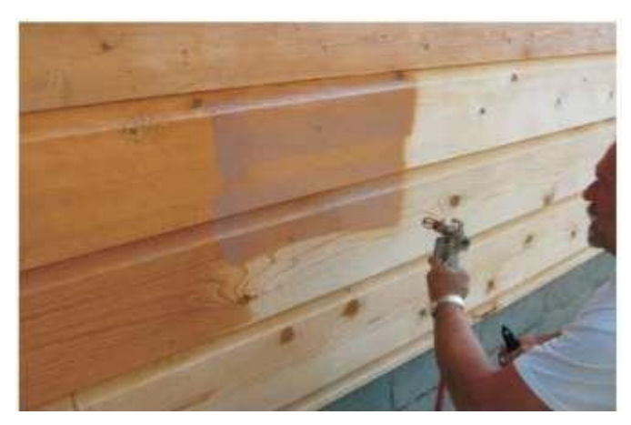
Spray apply finish to a small area

The other method is to use the airless sprayer to carry the finish to the wall where it can then be brushed. The trick is to work on small areas at a time. Although it takes longer than spraying large areas at a time, a single person can use this technique to finish their entire home. The objective is to apply the finish to a one to two foot section of one or two courses of logs and then brush out what you have applied as far as it will go. You do not want to apply too much finish and you have to be quick with the back-brushing to avoid any stain from running down the wall. Just remember – A THIN, EVEN COAT is the key.