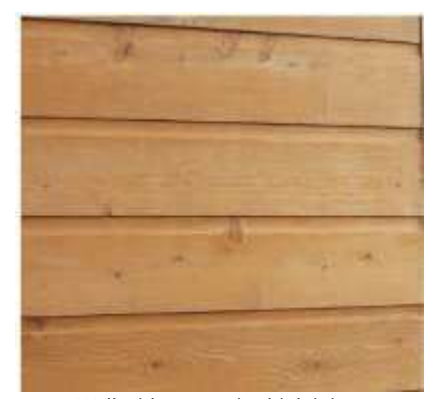
Wall with cosmetic chink joints

For cosmetic chink joints that are 3/8 inches deep or deeper Perma-Chink may be used but you should be aware that Chink Paint is a less expensive alternative that's much easier to apply. If the joint is deep enough to accommodate both backing material and the proper thickness of Perma-Chink it's best to actually chink it to prevent water from accumulating on top of the bottom lip.