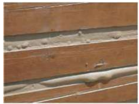
Blisters in thin layer of chinking applied over bare wood