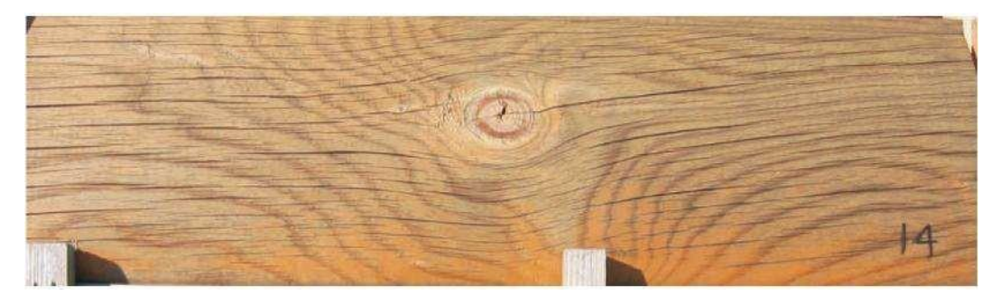
Fissuring of Log Siding

Log siding is typically used on dormers and gable ends. Depending on the quality of log siding, the effects of weathering can be worse than those observed for round logs. Log siding is sometimes manufactured from green wood. This makes it more susceptible to twisting, warping and cracking. Since siding does not have the high thermal mass of full logs, during the summer months their temperature can range from 80° F to 160° F or higher during the course of one day. This puts much more mechanical stress on both the siding and its finish system resulting in small fissures forming on the surface. Rainwater can then enter these fissures and get behind the finish.