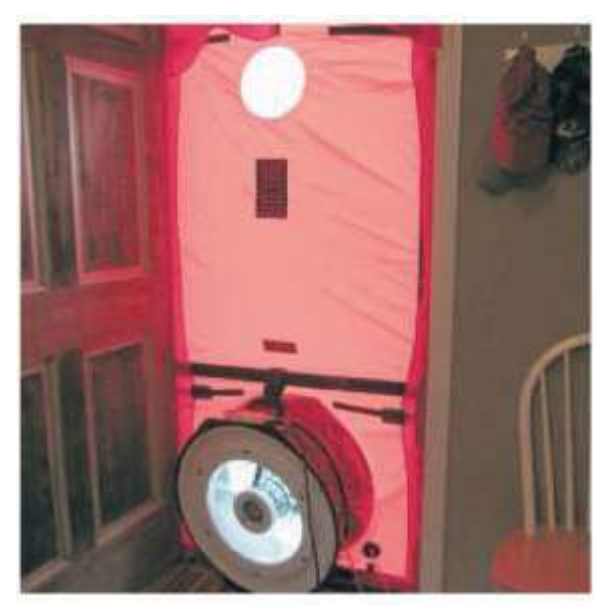
Door opening exhaust fan

Maintenance caulking is really a two person job, one outside doing the sealing and one inside feeling for the leaks. Finding the outside source of the leak may not be as easy as it sounds, especially around window and door frames. The opening source of the leak may be several inches from the spot where it is felt inside the home. It's just a matter of continuing to seal the area until the person on the inside no longer detects the air leak.