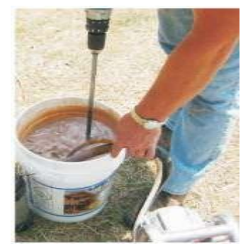
Step 1- Mixing

When using pigmented stains we also recommend "boxing" containers to avoid any slight color differences as you go from container to container. The best way to do this is to mix up each pail then pour some LIFELINE™ from at least two pails into a separate container. As the working container gets low add additional LIFELINE™, but first mix the contents of the pail.