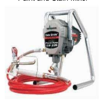
Wagner 9140S Airless Sprayer