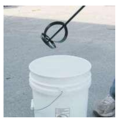
Step 4: Mix the Wood ReNew™ with the water using a paint mixer and an electric drill.