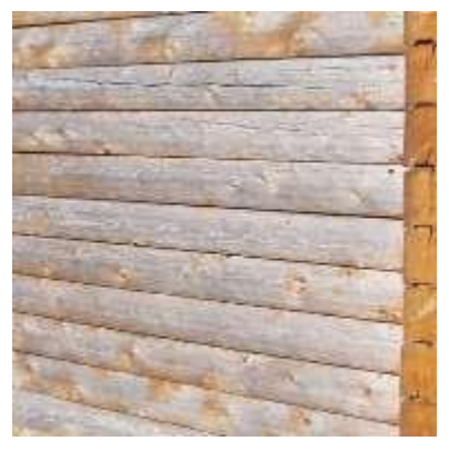
Step 1: Use Wood ReNew™ to remove grayed surface wood.