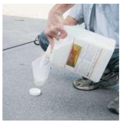
Step 2: Only measure out enough Wood ReNew™ to add to a few gallons of water (0.8 cups per gallon) at a time. You need to use whatever you mix within 1 to 2 hours.