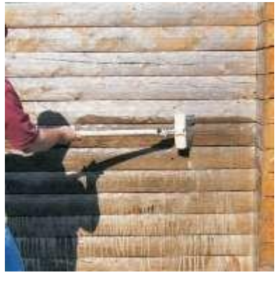
Step 6: Apply the Wood ReNew™ solution to the wall with a mop, broom or car wash brush. Start at the bottom of the wall and work up. Allow the solution to remain on the for 10 minutes.