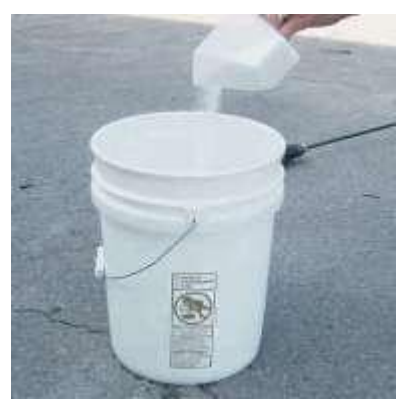
Step 3: Pour the Wood ReNew™ into a pail that contains the water. Do not mix Wood ReNew™ in a sprayer.