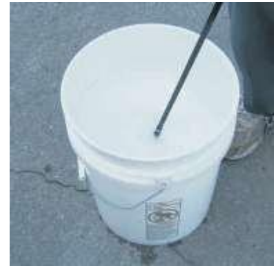
Step 5: Stir for about five minutes or until no undissolved granules are visible. Allow the solution to thicken for 10 minutes