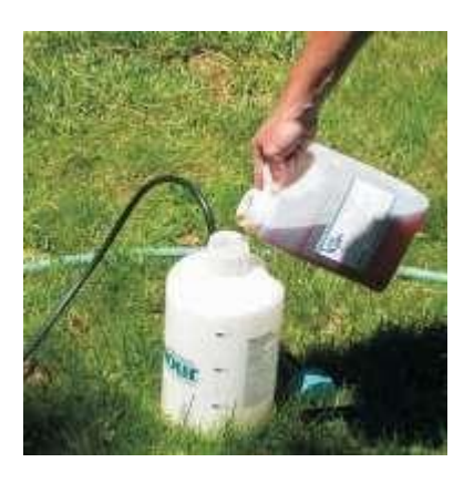
Step 1: Add 1 gallon of water to your sprayer then add approximately 2 cups of Log Wash. If you add the Log Wash first the sprayer will fill with foam. Be sure solution is mixed.