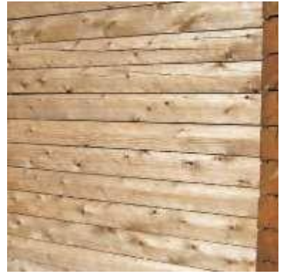
Step 10: Once the wood dries many of the dark discolorations will disappear. This is the same wall that appears in the previous step after drying for three hours.