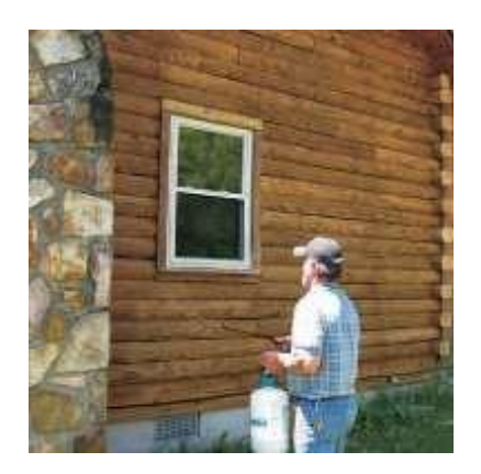
Step 2: Spray the surface with the mixed Log Wash solution. Start at the bottom and work up. Allow 10 to 15 minutes contact time. Do not allow the surface to dry.