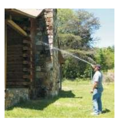
Step 3: If necessary, scrub the wall starting at the bottom and work up then rinse from the top down until you see no more foam running down the wall.