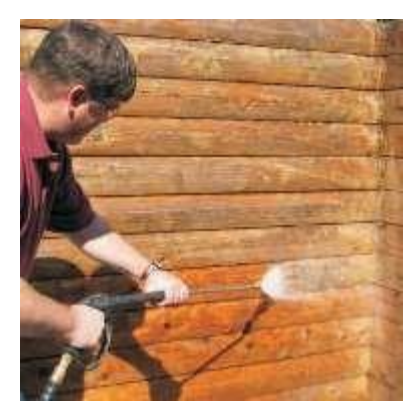
7: Pressure wash starting at the bottom of the wall. Work on 2 or 3 courses of logs at a time. Hold the wand at a 30 to 45 degree angle to avoid feathering the wood.