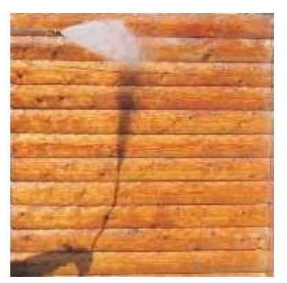
Step 8: Once the entire wall is pressure washed, rinse the wall starting at the top and work down. At this stage water volume is more important than pressure.