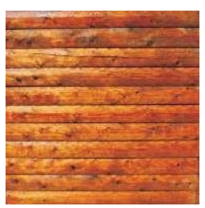
Step 9: Never judge the effectiveness of Wood ReNew™ or any other cleaner while the wood is still wet.