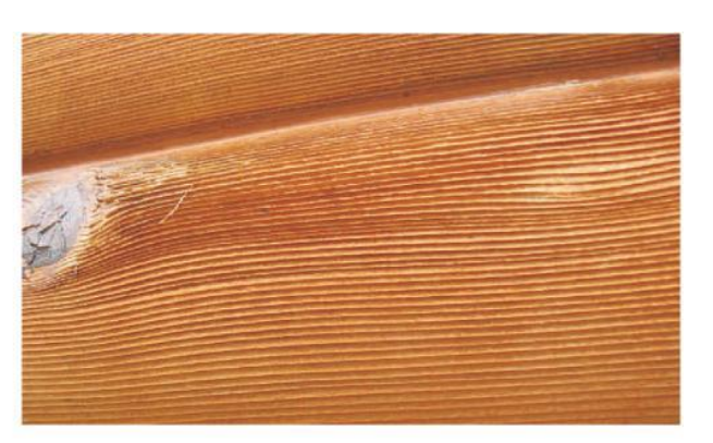
Examples of Media Blasted Surfaces