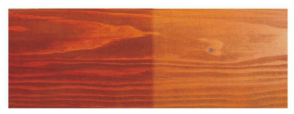
Stained Blasted Surface Without Prelude