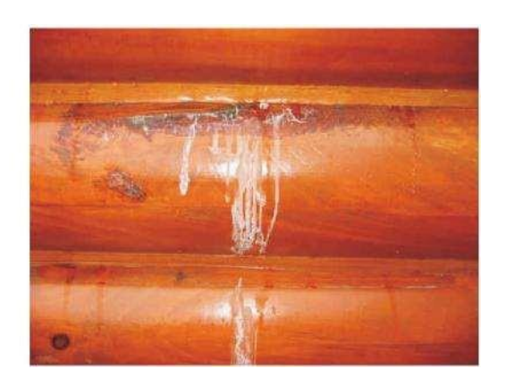
Examples of Resin Bleed